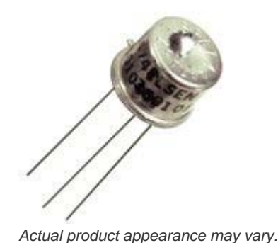
3601 Series TO-5 Thermal Switches